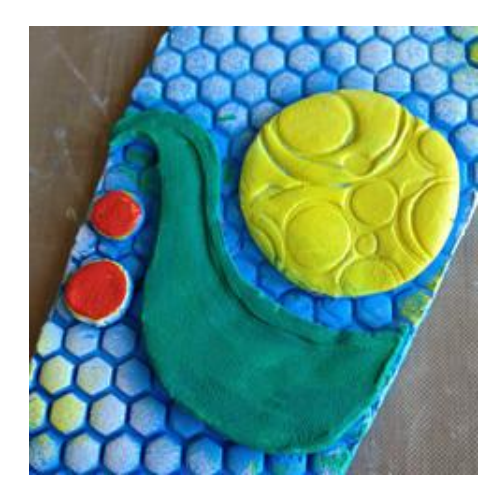
10. When the paint is dry, brush 1-2 coats of a gloss sealer medium over the top and sides; let dry.

ACTÍVA Products 512 S. Garrett, Marshall, TX 75670 903-938-2224 www.activaproducts.com